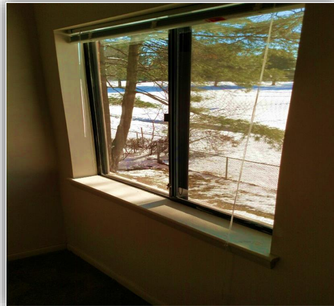
Interior photo of window unit at Bauer Park Apartments. January, 2019.

Notes: 1 The scope did not include the new storefront windows in the common area first floor of Building One (14635 Bauer Drive) due to the upcoming Renovation scheduled to occur post-conversion under Component Two of the Rental Assistance Demonstration ("RAD") program.